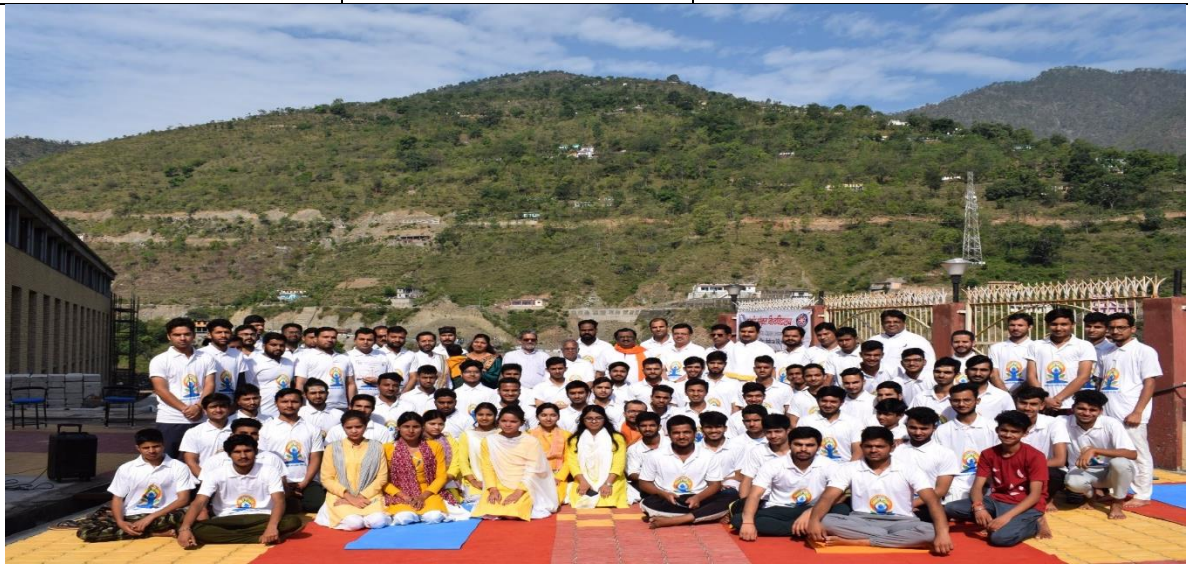
Teachers, Students and other faculty Members